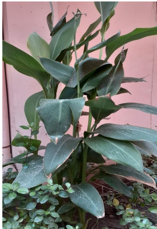
Waste water from canteen is treated using Canna sps